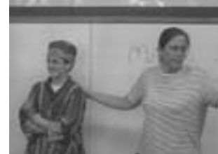
Learning about African culture.